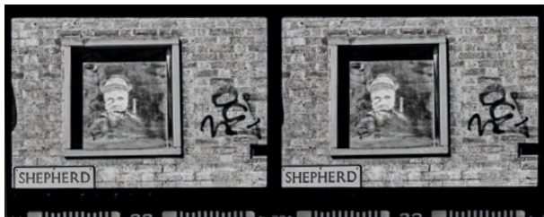
Duplication. Paranoïa getting the first shot in focus. Shot on Ilford FP4 with a Canon EOS 3.