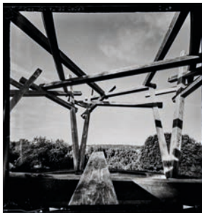
Various Pinhole, 2024. Shot on Iford FP4 with a Zero Image 1000 pinhole camera.